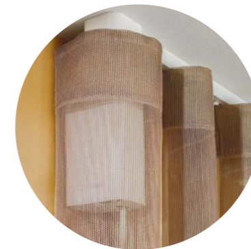
Electric curtain tracks